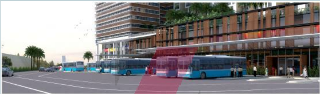
Joyos Hubtown, Surat