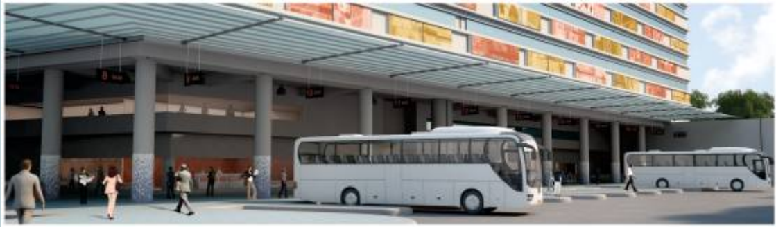
Joyos Hubtown, Ahmedabad