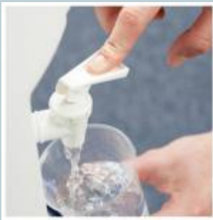
Drinking Water Booths