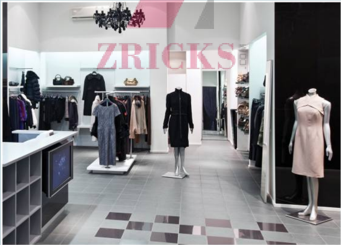
Flexible Floor Plates