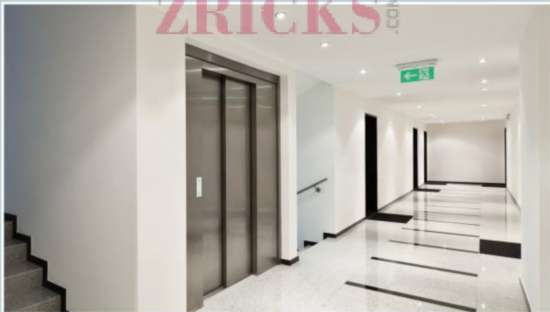
Automatic Elevators – separate for passengers and goods