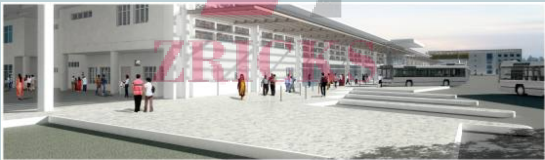
Joyos Hubtown, Mehsana