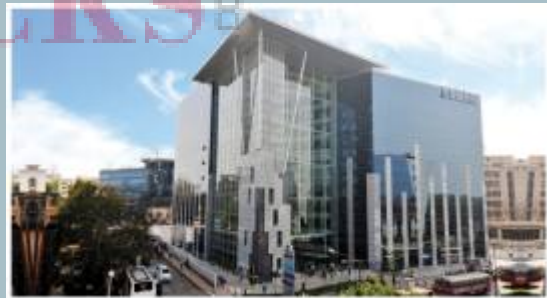
Ackruti Star - Andheri (E), Mumbai