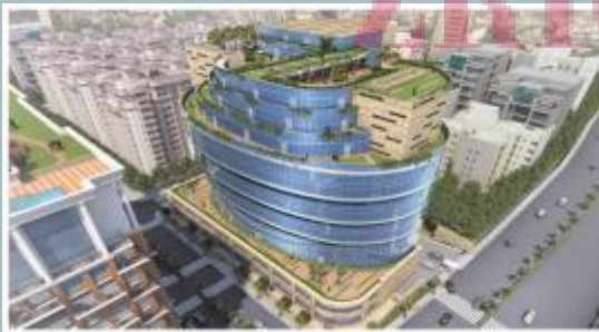
Hubtown Solaris - Andheri (E), Mumbai