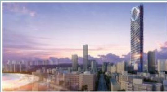
Hubtown Realms - Hughes Road, Mumbai