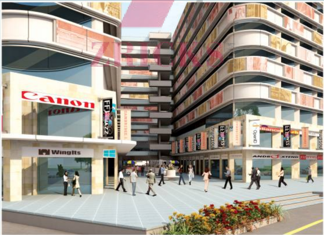
Wide Open Plaza