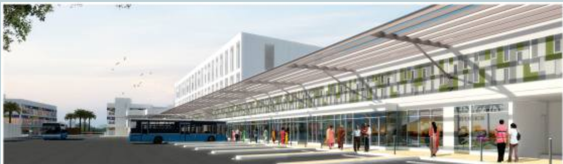
Joyos Hubtown, Vadodara

* Pictures shown are representational only and are liable to change as per final standards.