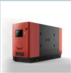
Power Back-up for Common Areas