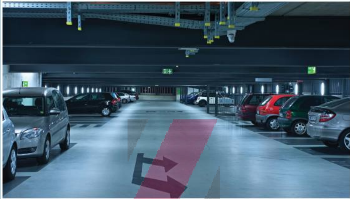
Covered Parking Area