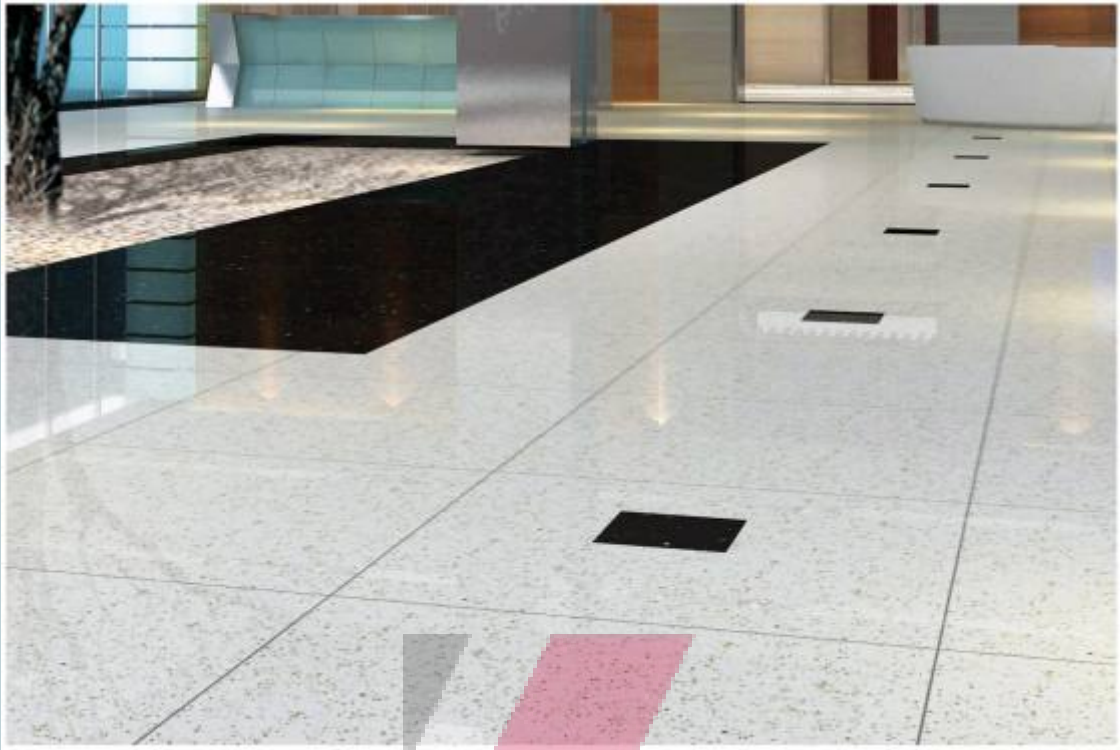
Fully Vitrified Flooring