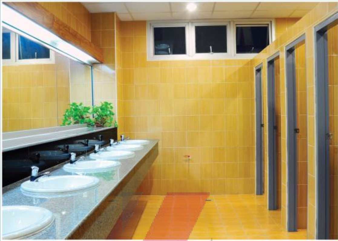
Well Designed Washrooms