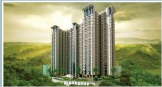
Hillcrest - JVL, Mumbai